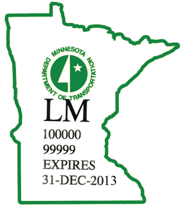
Minnesota Limousine Vehicle Decal

Luxury passenger automobile does not include a bus, pickup truck, truck, or taxi cab. Limousines meeting these criteria must be registered and display a decal. The Permit must be kept at the principal place of business and in each vehicle.