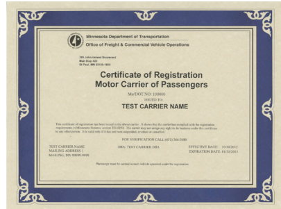
Intrastate Motor Carrier of Passengers Certificate