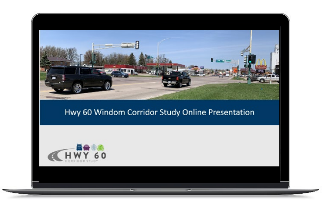
Figure 1: Summary of Phase Two Engagement Strategies

The purpose of the second phase of community engagement for the Hwy 60 Windom Corridor Study was to share the design concepts by subarea and technical analysis, and to collect feedback on the draft design highway concepts. This phase of engagement occurred between October 2020 and January 2021. Figure 1 shows the engagement strategies used.