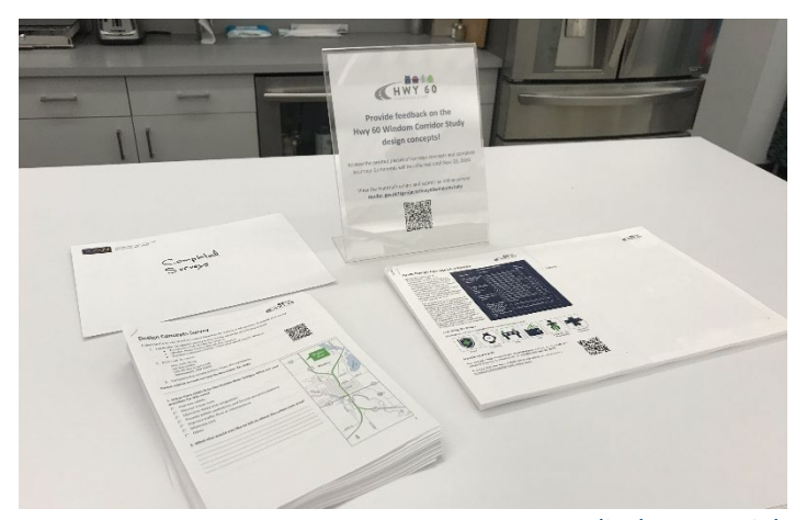
Pop-up display materials

Pop-up displays with printed project materials were placed in local gathering centers for people to review design comments and submit completed surveys. Two people mailed completed surveys from the pop-up displays.