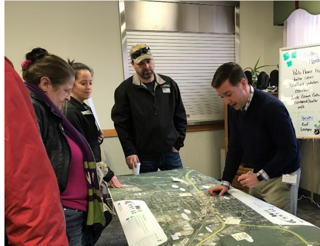
Figure 2: Open house attendees identify issues and opportunities