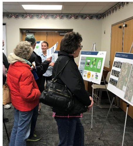
Figure 1: Open house attendees review display boards

The meeting was conducted in an open house format. Staff utilized display boards, aerial maps of the corridor, and an interactive priorities exercise to communicate the project's purpose and goals, and collect feedback from the community. Project staff facilitated discussion to collect substantive comments from attendees and answer question. A comment sheet was also provided at the open house for people who preferred to write their comments (see page 4).