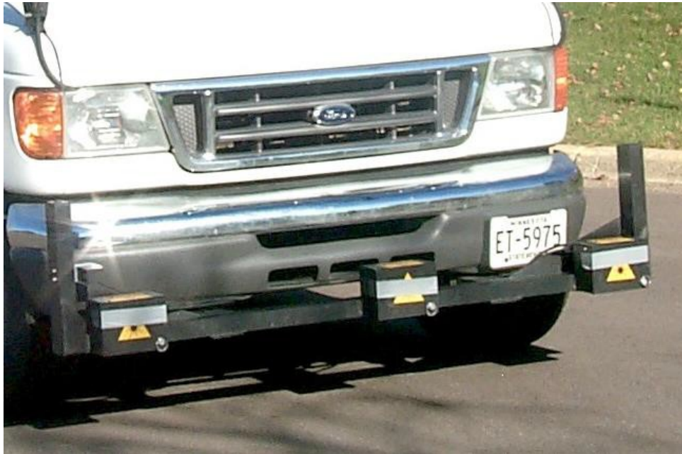
Figure 2. Close-up of lasers used to measure roughness & faulting.

compare the performance of different roadways, pavement designs and for project planning and programming.