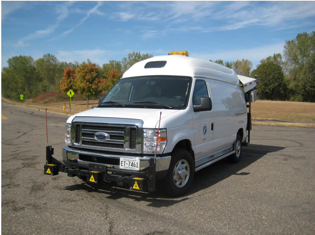
Figure 1. MnDOT's Pathway Services, Inc. Digital Inspection Vehicle (DIV)

MnDOT currently collects pavement condition data using a Pathway Services, Inc. Digital Inspection Vehicle (DIV) as shown in Figure 1. There are three lasers mounted across the front bumper, one in each wheel path and one in the center (Figure 2). In addition, there are two lasers used for rut measurements (Figure 3) and for collecting 3-dimensional images of the pavement surface (Figure 4) mounted on the rear of the vehicle. The front lasers measure the pavement's longitudinal profile, used to calculate roughness. They take a measurement approximately every 1/8-inch as the van travels down the roadway at highway speed. The cameras are used to capture the pavement distress (cracking, patching, etc.), right-of-way images, and help assess the overall condition of the shoulders.