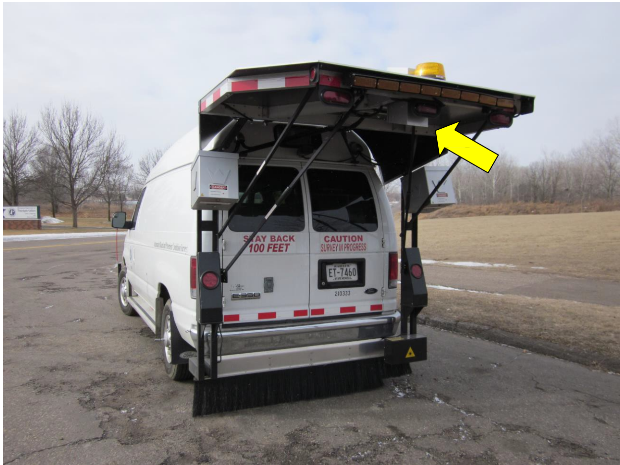
Figure 4. Close-up of 3D camera used to record pavement distress.