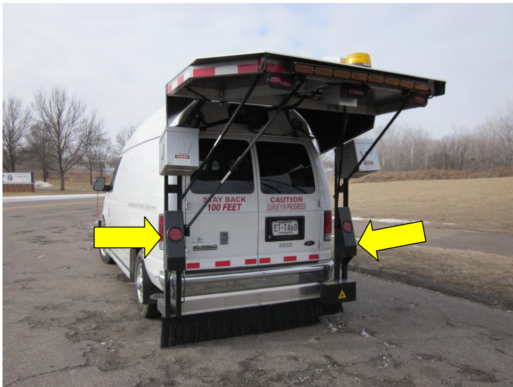
Figure 3. Close-up of 3D-Rut Measurement Lasers.